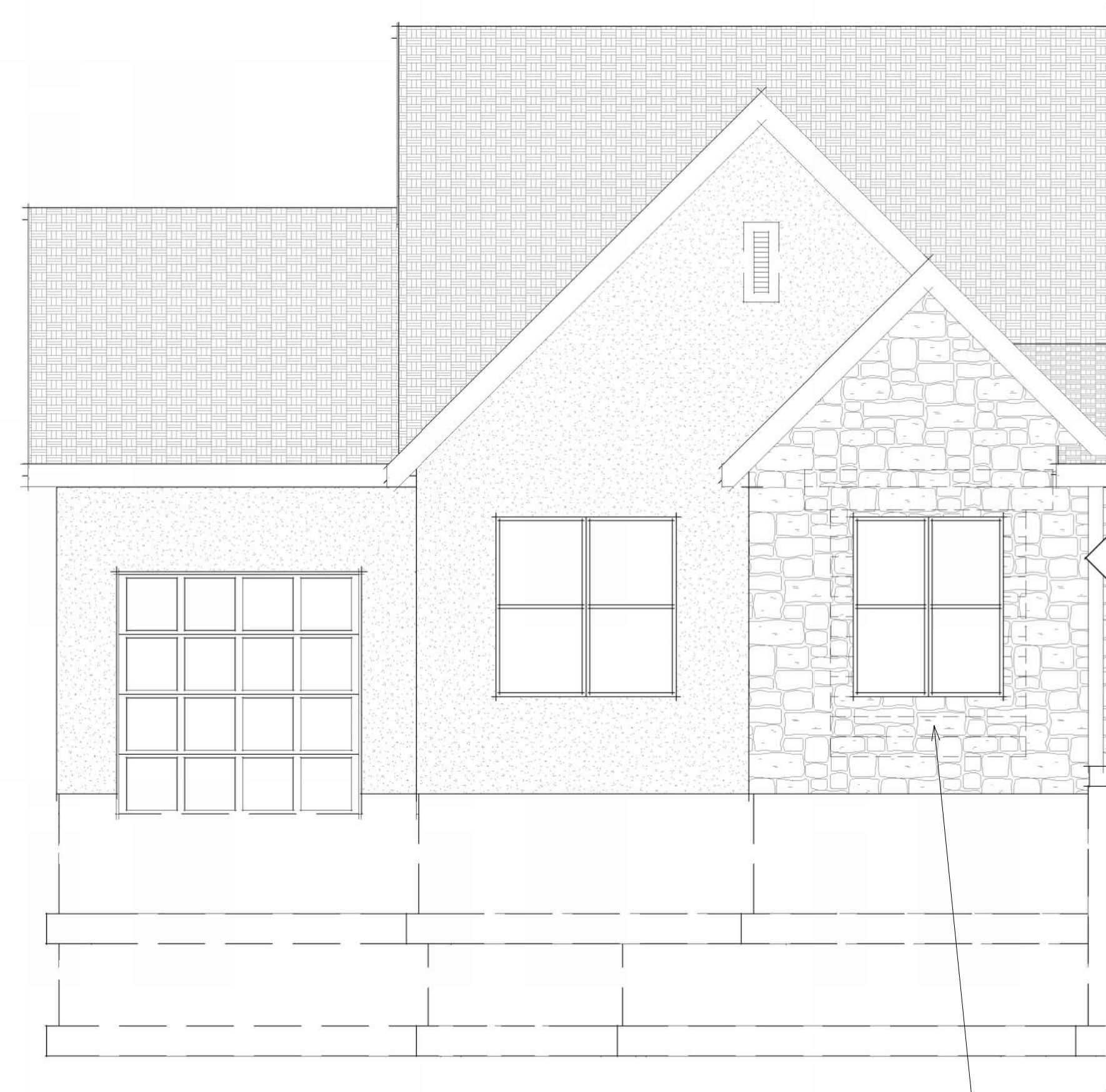
SIDE LOAD 3-CAR GARAGE