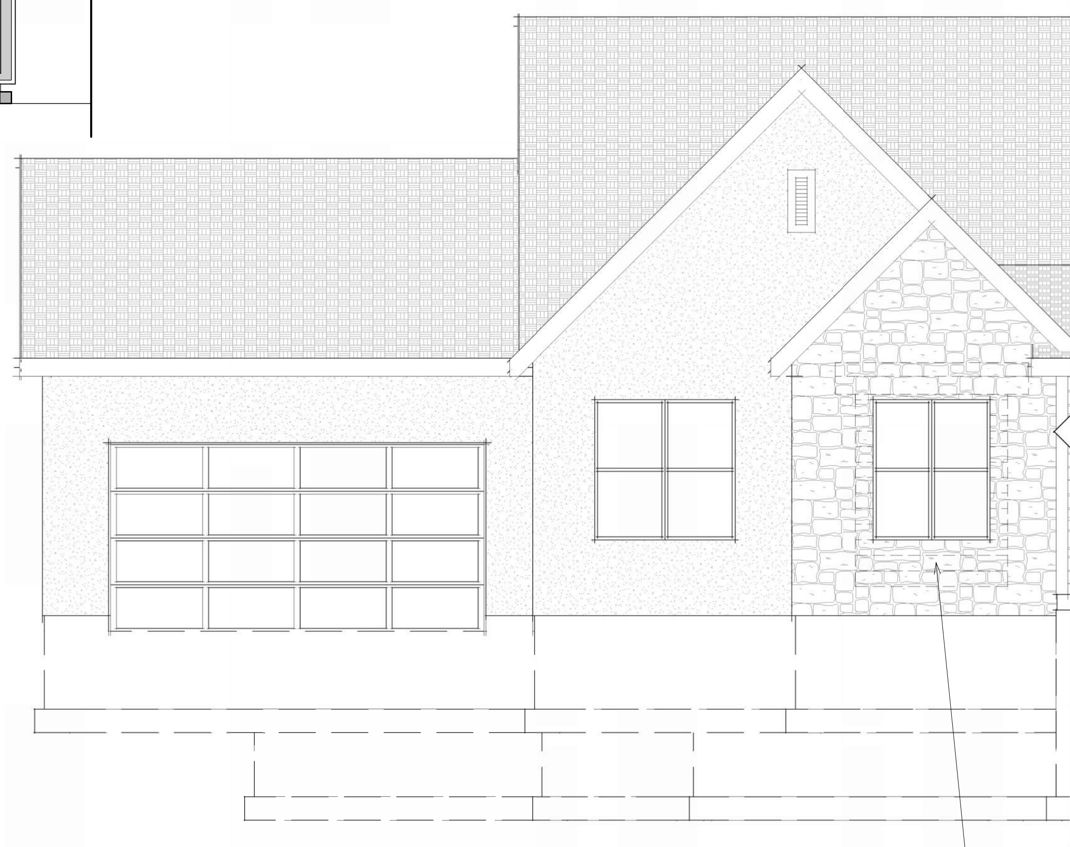
SIDE LOAD 4-CAR GARAGE

Disclosure: Home SQFT--both finished and unfinished--are approximate and are subject to change. Please see sales agent for further information.